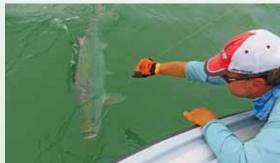
Competition is strictly catch and release at the site of the catch.