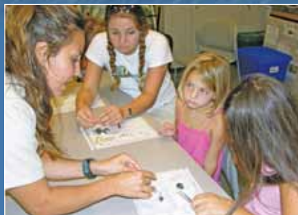
Owl pellet dissection: a popular and valuable student learning experience.

"Ding" Darling Wildlife Society, the nonprofit Friends of the Refuge organization, supports environmental education, services, and land conservation at the J.N. "Ding" Darling National Wildlife Refuge Complex. Education and conservation efforts may extend beyond the complex's borders. We partner in these efforts where possible with like-minded conservation organizations.