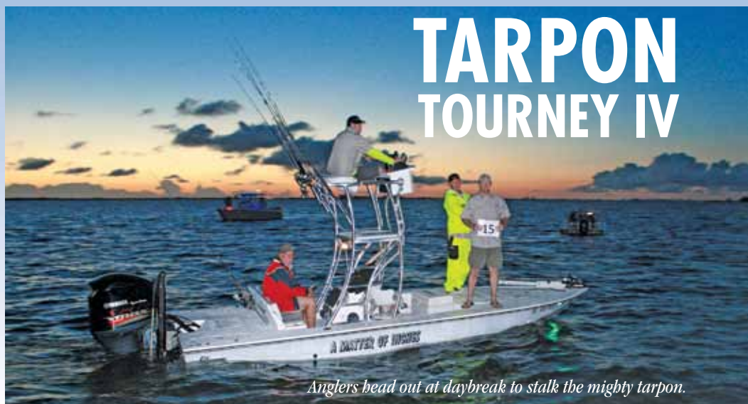
Anglers head out at daybreak to stalk the mighty tarpon.

A 100% purse promises to make the fourth annual "Ding" Darling & Doc Ford's Tarpon Tournament on May 9, 2015, the hottest competition on the water. It pays out 100% of the entry fee ($500 per boat of up to four) as tournament awards.