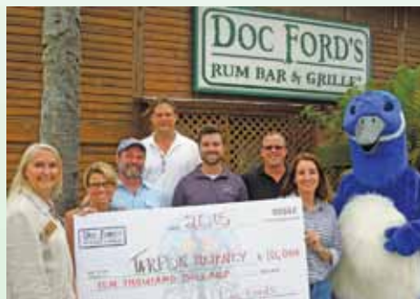
Once again Doc Ford's Rum Bar & Grille title sponsors the fourth annual tournament