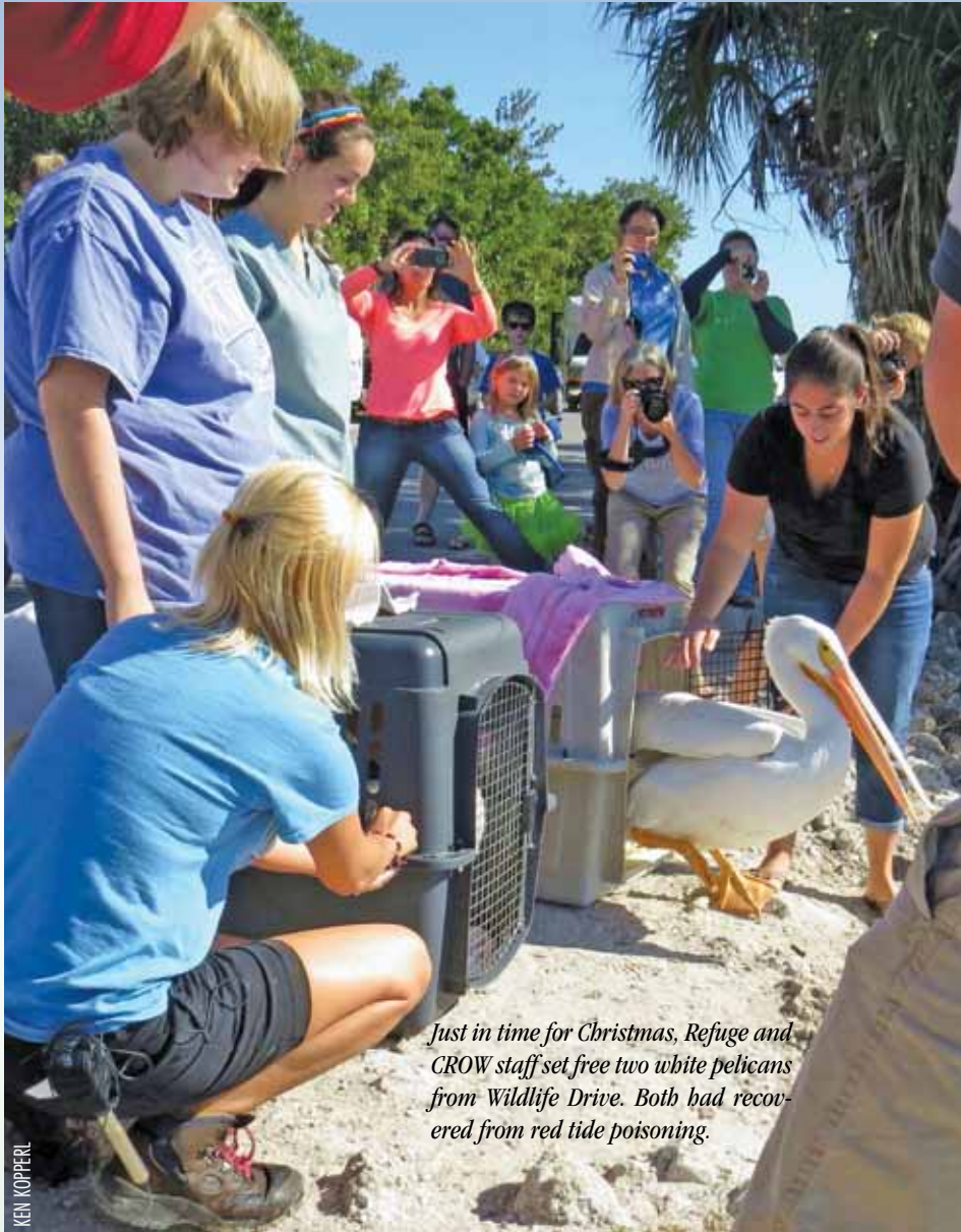
Just in time for Christmas, Refuge and CROW staff set free two white pelicans from Wildlife Drive. Both had recovered from red tide poisoning.

Winter Season 2014-2015 kicked off with Holiday Happy Hour Shopping, our annual Volunteers Holiday Luncheon, and a Refuge-DDWS presentation at the Sanibel & Captiva Islands Chamber of Commerce Holiday Business Lunch.