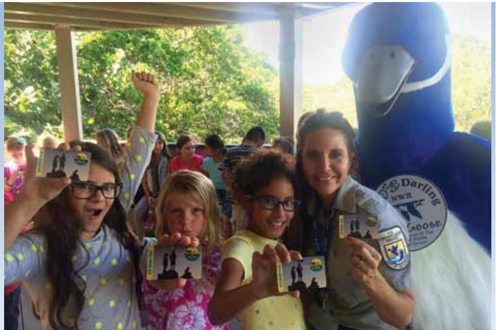
The Sanibel School fourth-grade class recently visited to get their passes.