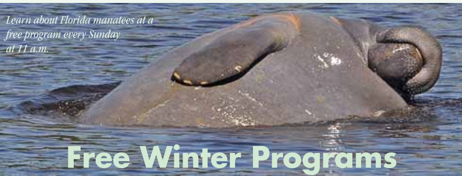
Learn about Florida manatees at a free program every Sunday at 11 a.m.

For more information, visit everykidinapark.gov . For questions about obtaining a pass at "Ding" Darling, call 239-472-1100 ext. 237.