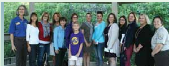
Thirteen teachers received conservation education grants from the "Ding" Darling Wildlife Society this year.