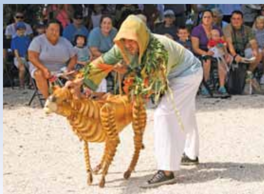
IBEX Puppetry was on hand to once again wow Family Fun Day visitors with wildlife pageantry.