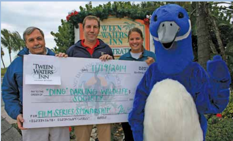
Thanks to Tween Waters Inn for its generous support of this season's film series