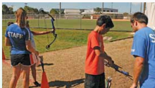
Above: We added archery lessons to the Family Fun Day repertoire this year.