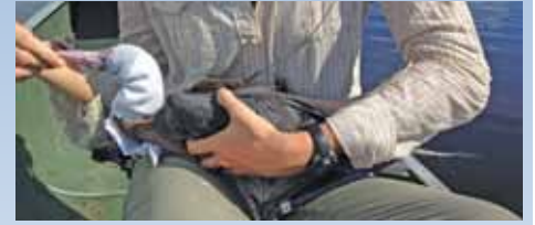
A researcher prepares a reddish egret for its study mission.

During June 2014, the Avian Research and Conservation Institute (ARCI) in Gainesville, Florida, trapped and fitted a satellite transmitter on a reddish egret within the Refuge as part of a larger reddish egret forage habitat research study. Information on this egret, including date tagged, movement history, and maps is available at http://arcinst.org/arci-tracking-studies .