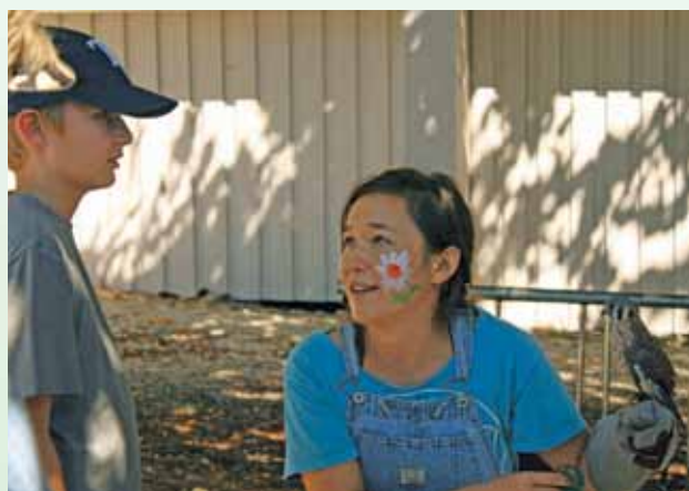
Live wildlife is always a bit on Family Fun Day.