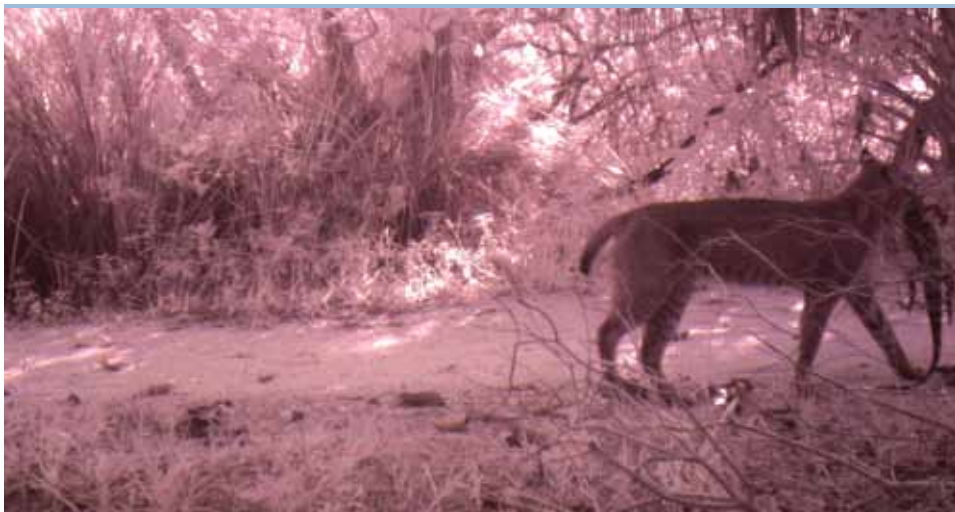
Wildlife motion-activated cameras capture valuable images such as this one of a bobcat carrying a juvenile alligator in its mouth. The Refuge hopes to buy three more to expand coverage.