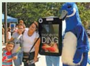
Below: Our "Happy Appy" and Blue Goose mascots posed for photo opps.

The new "Discover Ding" game app, scavenger hunts, archery lessons, special tram tours, free paddleboarding, and a lot of flap about duck stamps: The 25th annual "Ding" Darling Days attracted thousands of visitors throughout the week of October 19-25 — our most well-attended event in our 25-year history. Thanks to Tarpon Bay Explorers and all of our wonderful generous sponsors for boosting us to success. See our glorious roll call of sponsors on page 2.