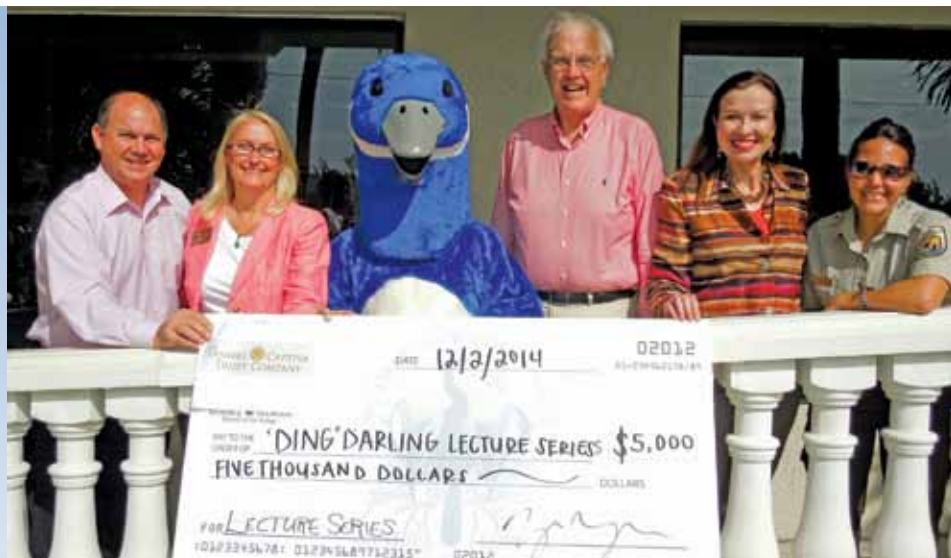
Sanibel Captiva Trust Company once again generously sponsors our Friday Lecture Series.

For more information, call 239-472-1100 ext. 241 or log on to www.dingdarlingsociety.org/lectures .