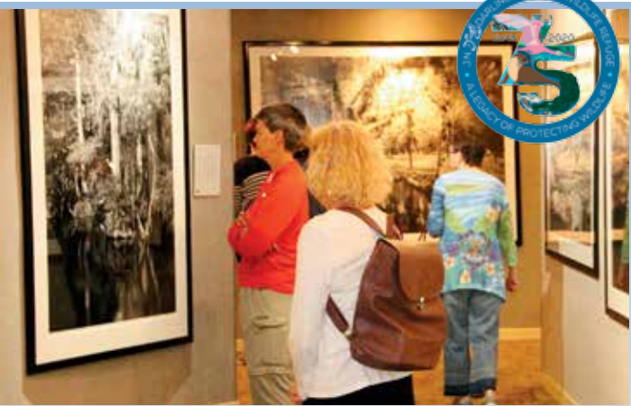
See the exhibition for free in the Visitor & Education Center through February 5.