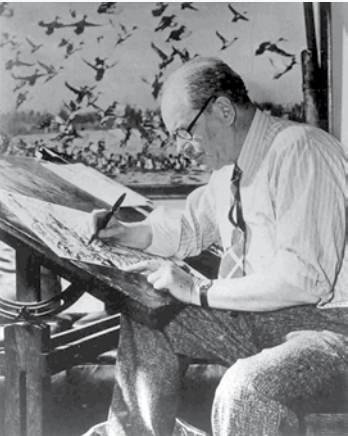
“Ding” Darling at work cartooning: Learn more about the man and his work at a free weekly program.