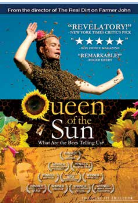
Queen of the Sun listens to bees on January 22.

limited and on a first-come basis. Below are the season’s scheduled films. All films begin at 1 p.m. A short discussion will follow each film. For more information, visit dingdarlingsociety.org/articles/lecture-and-film-series .