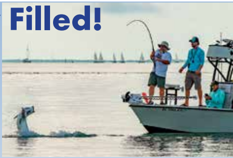
Action from last year’s tournament

22, this year is a catch, care, and release format that aims to educate the fishing community about ethical fishing practices and the importance of water quality. All registration fees return to the anglers in the form of prize awards. Refuge support comes entirely from sponsorships and silent auction proceeds. Visit ding-darlingtarpontourney.org for details.