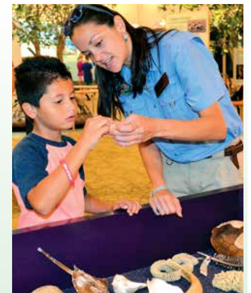
WoW will deliver hands-on nature enrichment to all ages.

Donations will fund learning stations that interpret mangrove ecosystems, water quality, water conservation, pollution and plastic, animal scat and tracks, Florida's native animals, wildlife sounds, and other topics that meet the Ref-